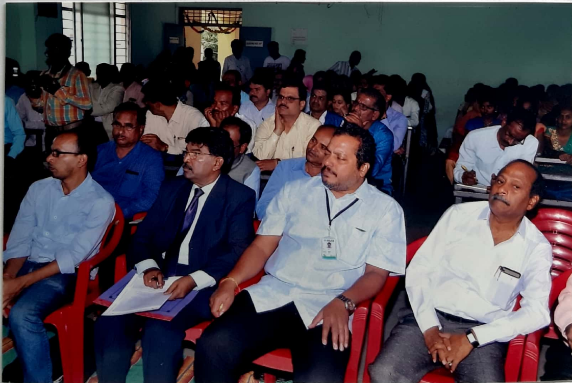
Faculty Members, research Scholars, Students and other participants of the seminar.

S. J. M. PRINCIPAL S.J.M. Arts College for Women, CHITRADURGA - 577 501 Karnataka.