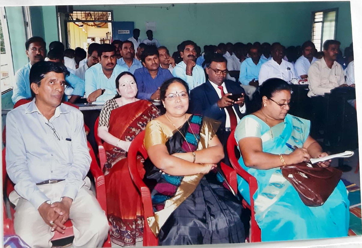
Faculty Members, research Scholars, Students and other participants of the seminar.

S. J. M. Arts College CHITRADURGA-577501, KARNATAKA Re-accredited with 'B' Grade by NAAC